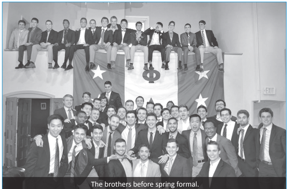
The brothers before spring formal.

We are extremely proud of the many accomplishments our members have achieved in recruitment and academics this year, working to truthfully embody (continued on page three)